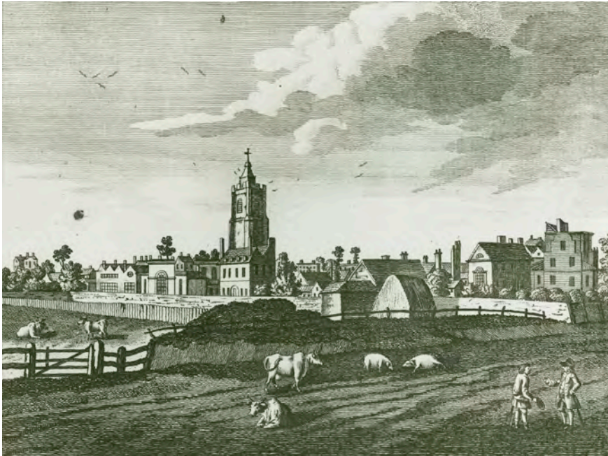
Figure 6.1: Hackney. William Thornton (1784, facing 488).

Located two miles northeast of London, the village of Hackney was best known as a place where rich Londoners had their country seats. Between London and Hackney the traffic was so heavy that “hackney” became the general word for coaches of the type used there. With its magnificent playing fields and clean air, Hackney Academy enjoyed a reputation for healthy living, and like other private schools it was thought to answer the standard complaints about the public schools, their rampant sexuality. 6 The school to which Charles Cavendish sent his sons was seen as respectable, up-to-date, healthy, and safe.