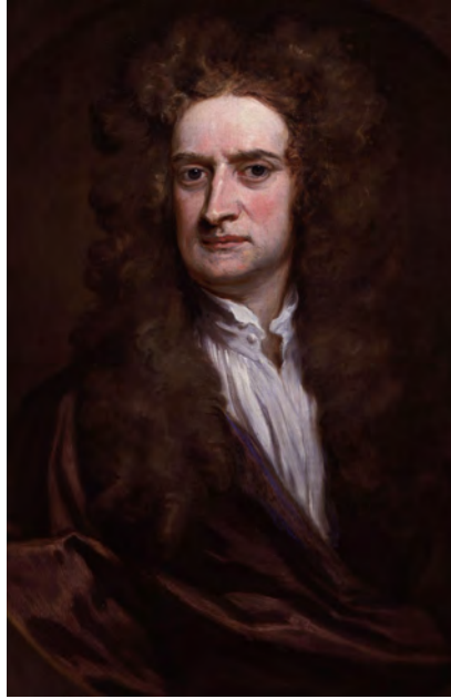
Figure 6.3: Sir Isaac Newton. Portrait by Godfrey Kneller, 1702.

Newton's principal physical writings were widely accessible, but his published mathematical writings at the time of his death consisted of a few scattered tracts, which by no means revealed the extent of his researches. In the Principia , he introduced the mathematical ideas his readers needed to understand what followed, and in the first edition of Opticks he appended two Latin treatises on curves and their quadrature, which later came out in English translations. It was left to his followers to publish other mathematical writings, the existence of which was known since he lent out his manuscripts.