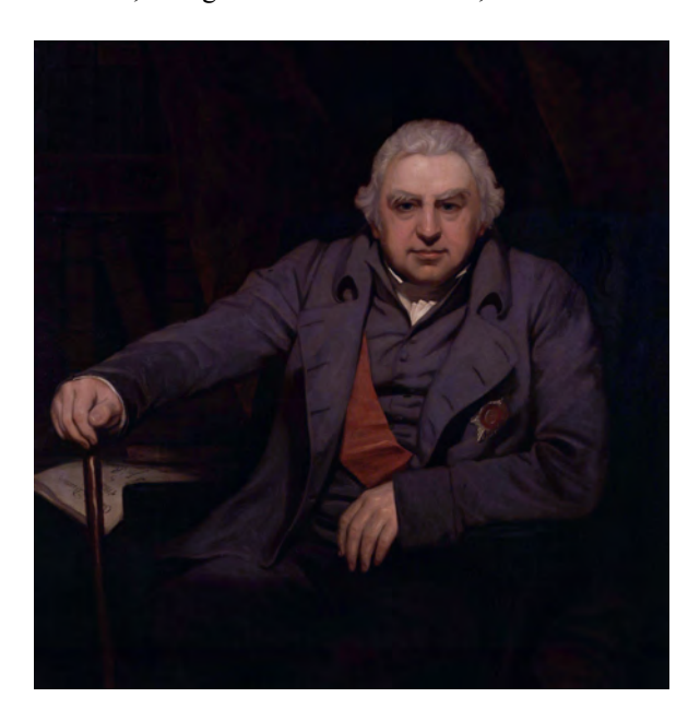
Figure 13.1: Sir Joseph Banks, Bt, by Thomas Phillips, 1810. Wikimedia Commons.

thought, of a bias against men of the mathematical sciences, in favor of men of rank and and men of the life sciences. Their dissatisfaction with Banks came to a head in, as Weld turned it, the "violent dissensions, foreign to matters of science," of 1783 and 1784.