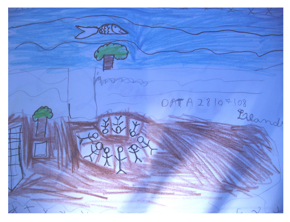
Figure 23.6: Drawing by a Guarani third-grade child from the Boa Esperança school.

Traditionally, the Tupinikim and Guarani were hunters and gatherers; through the practice of hunting and gathering, they developed the knowledge necessary for their survival. Thus, they constructed and used various hunting tools, such as bows and arrows, spears, as well as traps for fish and game. In addition, they elaborated a special technique for spatial orientation when following animal and human trails. Today, however, that knowledge is hardly used and is practiced by only a few persons in the community, generally leaders or the elderly. The contact with the non-Indian has brought into the ethnic communities knowledge as well as instrumental and technological innovations that have replaced traditional usages. Eating habits are representative of such changes: for centuries, Tupinikim and Guarani nourished themselves by fishing, hunting and gathering, and only later agriculture. The use of industrialized food, however, has been rapidly adopted through contact with non-Indians, even though the older hunting, fishing and gathering practices have not been completely abandoned.