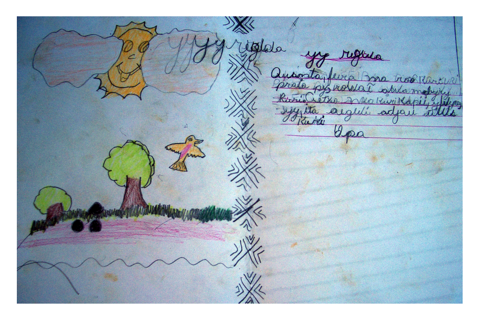
Figure 23.5: From a composition by a third-grade child in Silvio Carvalho Gonçalves' class at the Boa Esperança school.

[...] the command of the social, economic and cultural autonomy of each people, contextualized within the recovery of historical memory, the reassertion of ethnic identity, the study and valorization of their science as synthesized in their ethnic knowledge, as well as access to information and technical and scientific knowledge produced by the larger society and the other Indian and non-Indian societies. (Cota 2000, 56)