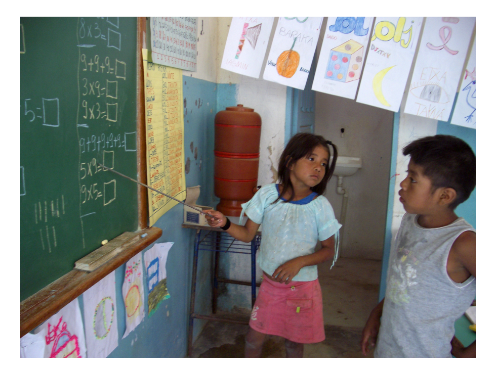
Figure 23.4: Third-grade Guarani children of the Aldeia Boa Esperança.

In 1993, the Guarani defined the education they want for their people as an "indigenous education," and not as an "education for Indians." They proposed the following guidelines: