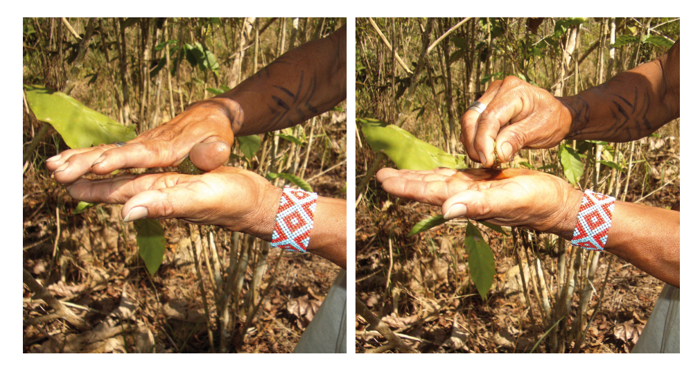
Figure 23.8: Process for obtaining dye from the leaves of the embaúba tree.

these techniques from his mother and grandmother. When asked about the disappearance of these techniques, he replied that "due to the exploitation by the White, who ruin the aboriginal forest, it became difficult to find the plants, so anilines were used as an alternative." The plants we now see in the village were planted with the goal of preserving or protecting them. Nevertheless, they are still too scant to be used for extraction. Jonas, who now works mainly making crafts, uses hardly any natural dyes, but rather industrial dyes and methods imported by the non-Indians. According to him, he makes crafts because his parents made them, and "if parents make, then the children will make too."