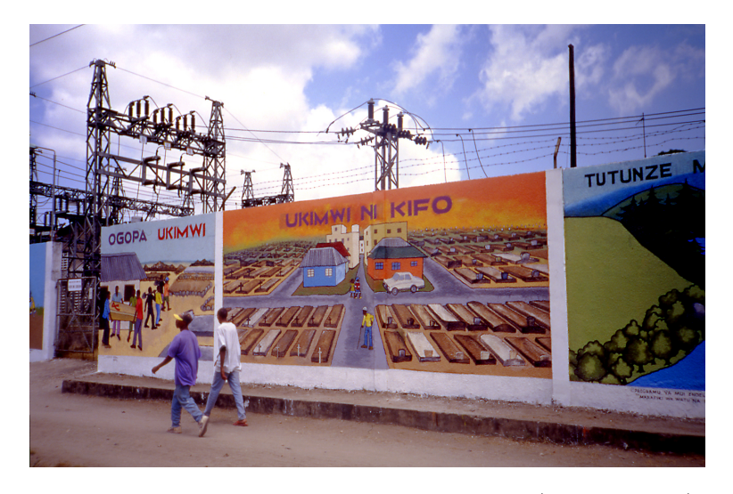
Figure 22.2: Mural painting in Tanzania, 1999.