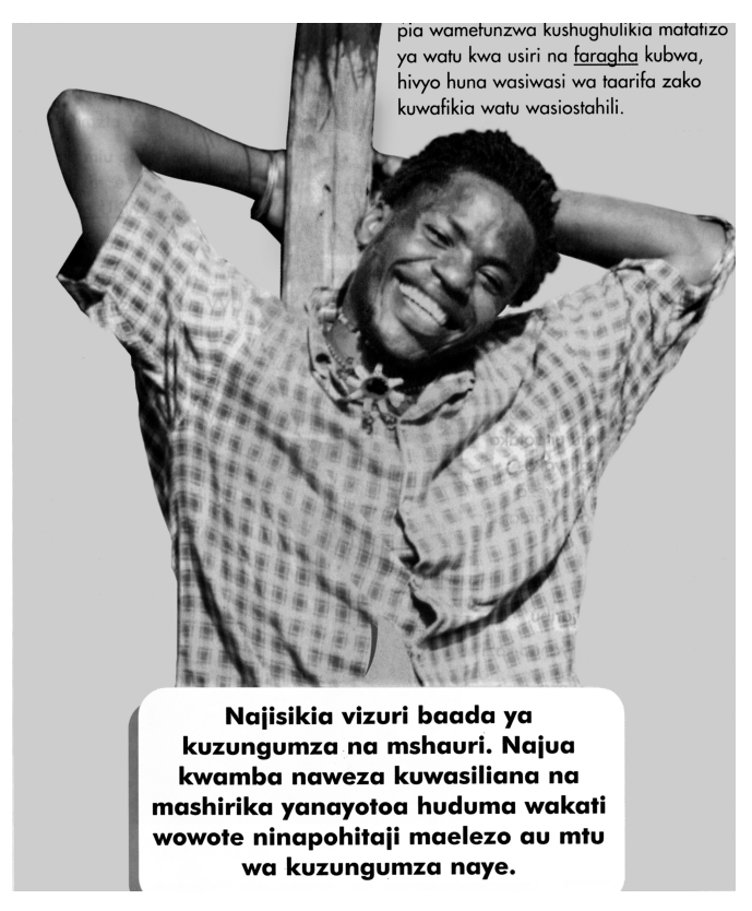
Figure 22.3: The aspect of individual and collective counseling is addressed in images and stories of hope as presented in the booklet "Living Positively" (Kuishi kwa Tumaini: Living with Hope). The main character of the picture story displayed here is confronted with an HIV-positive diagnosis and—after going through a period of internal struggle and despair—has accepted his HIV-positive status. He says: "After I have talked to the counselor, I feel good. I know that I can talk to these organizations. They offer services whenever I am in need of advice or when I need a person to talk to." The booklet "Living Positively with HIV" represents a good example of the way in which public health responses have become embedded in transnational channels of funding and knowledge production: The booklet has been adopted from the Soul City Institute for Health and Development Communication in South Africa and translated into Kiswahili and "culturally adapted to the Tanzanian setting" by the Health Information Project. (Femina, HIP, Tanzania)