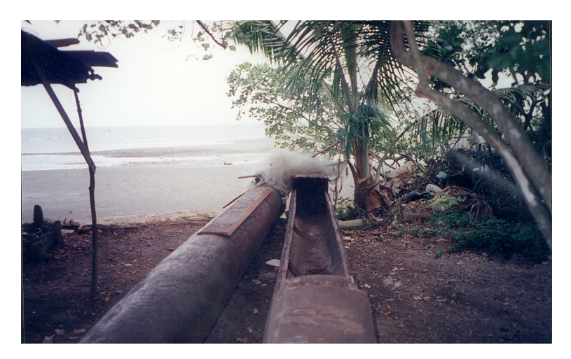
Figure 19.2: Remains of the canoes used for the famous trip to Suva.

original inhabitants are allowed to bury the dead on Moce. This was the only instance I observed where origins were relevant. There has been and continues to be considerable intermarriage between the two groups.<sup>1</sup>