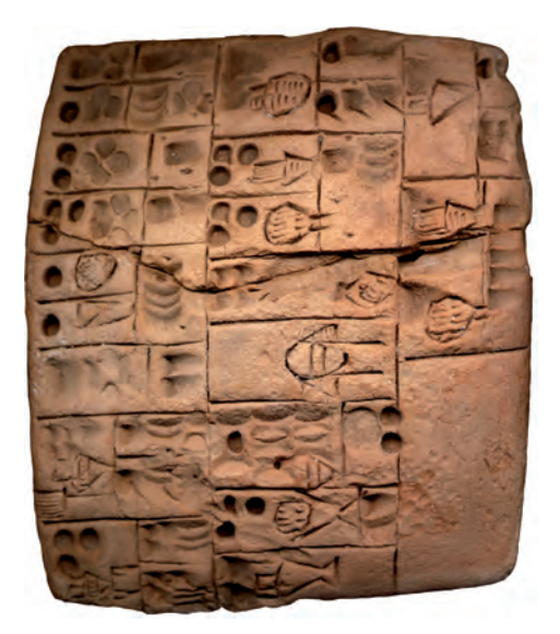
Figure 2.1: Proto-cuneiform tablet from Uruk (ca. 3 000 BCE) showing a calculation for the amounts of ingredients needed in the production of dry cereal products and beer. The transliteration is given below. See Nissen, Damerow, and Englund (1993, 42–43).

On Kushim's tablet, five different numerical systems are used: one for cereal products, another for beer containers, and three different systems for the cereals themselves. In other words, the quantification of these objects was linked to their quality, while an abstract system of numbers designating quantity independent of quality and context did not yet exist. Similarly, the non-numerical signs used on these clay tablets were not elements of a writing system aiming at a rendition of human language, but just representations of certain administrative categories. We are thus confronted not with a primitive version of modern writing or mathematics, but with an evidently efficient administrative tool of the archaic Mesopotamian society, a symbolic system, and a way of thinking in its own right that is not reducible to our modern categories.